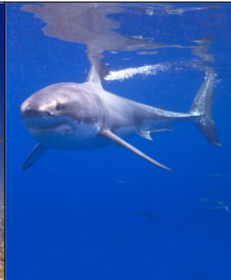
great white shark